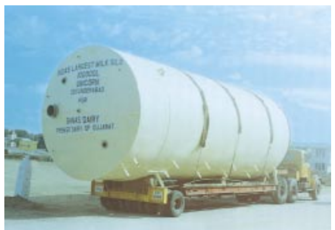
100 KL Cap. Milk Silo