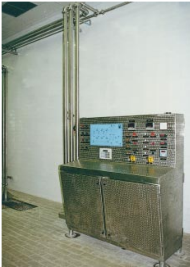
PLC Based Control Panel