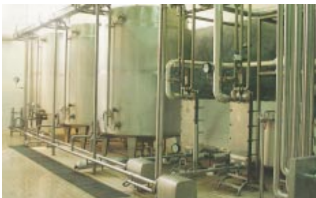
Automatic CIP System