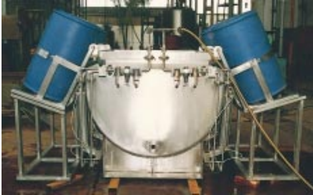
Viscous Liquid Dumping Station