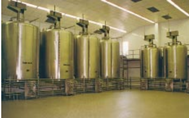
Beverage Preparation Plant