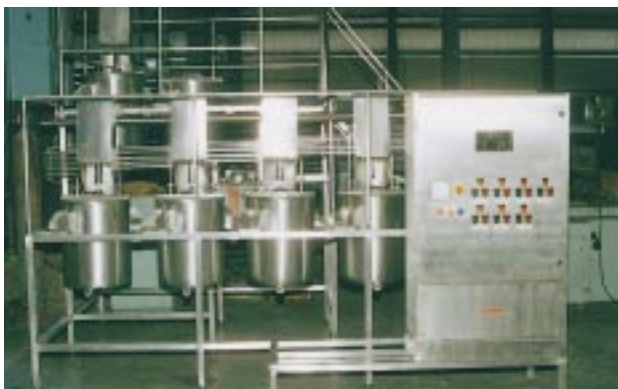
Skid Mounted Process Plant