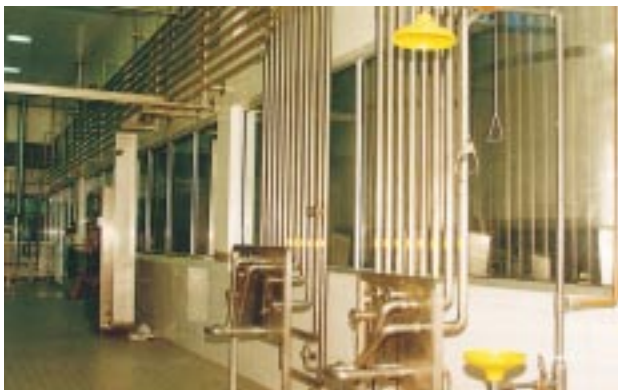
Stainless Steel Sanitary Piping System