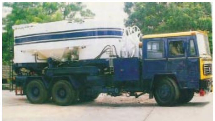
Mobile Explosive Blending and Charging Plant

Supply, Installation and Commissioning of complete Electrical System from the Sub-station to individual Equipments comprising of Sub-station, HT Switch Gears, LT Panels, Motor Control Centres, Conduit Laying, Cabling, Earthing Etc.