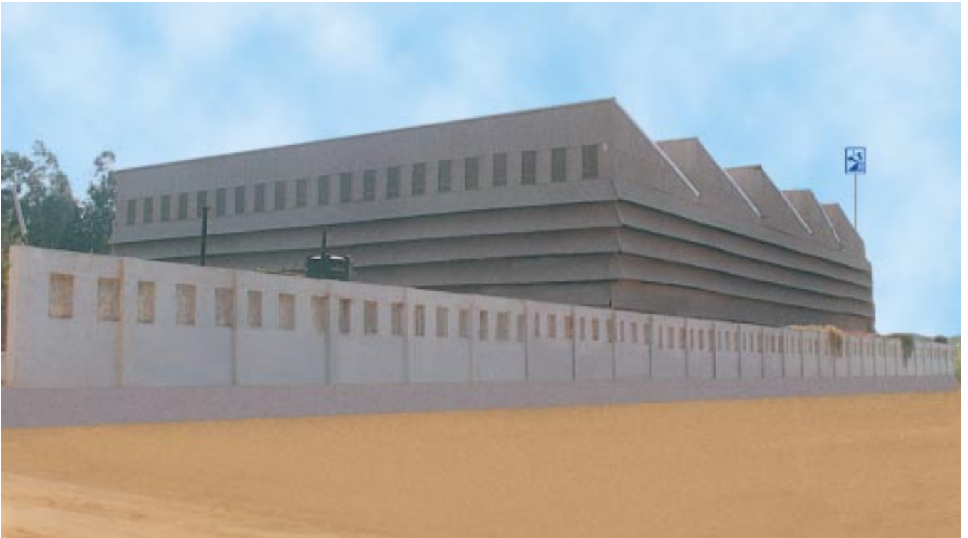
Out Side View of the Factory