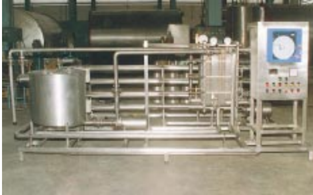
Skid Mounted HTST Pasteurisation Plant