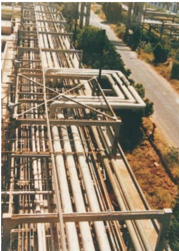
Utility Piping System